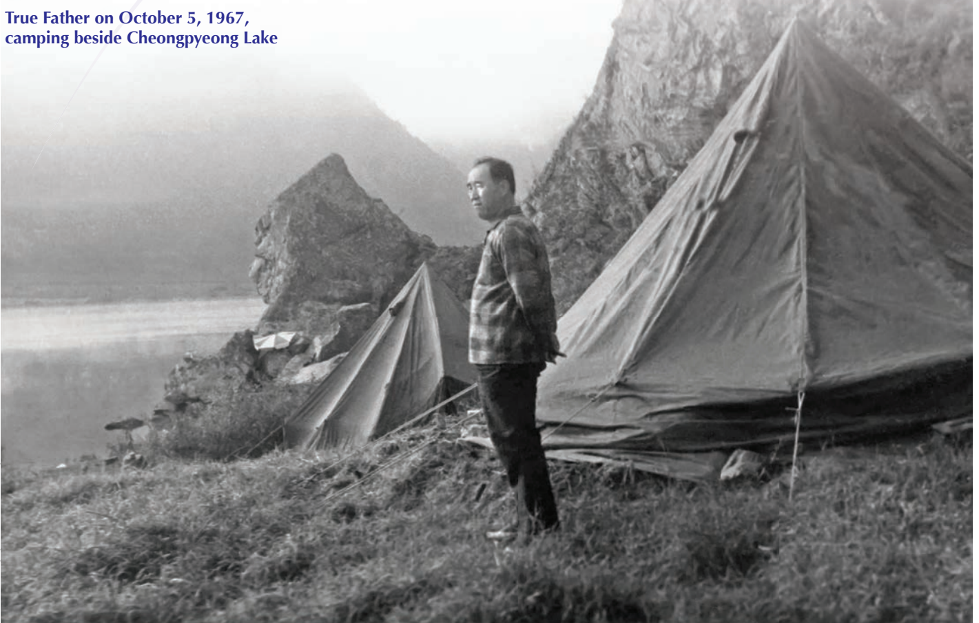
True Father on October 5, 1967, camping beside Cheongpyeong Lake

Why do we witness? To multiply. Multiplication does not arise through a vertical rela-