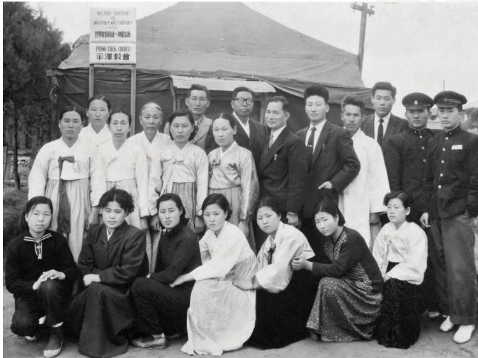
Members in Pyongtaek take a photograph with an itinerant Unificationist evangelist who is visiting their community during a campaign to double church membership.

The time has come when the young brother, Abel, can meet the older brother, Cain. That means it has become possible for