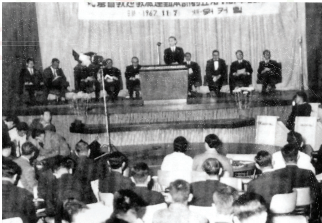
An interfaith meeting for some five hundred invited guests was held to mark the first anniversary of the establishment of the headquarters for the inter-denominational movement (November 7, 1967).

At first, Christian newspapers also tried to confront us and destroy us. Now, however, newspapers such as the Gospel Times came to apologize to us and asked for our forgiveness, saying that they would never attack us again. Christian Today , the United Christian Newspaper , and all the press organs that