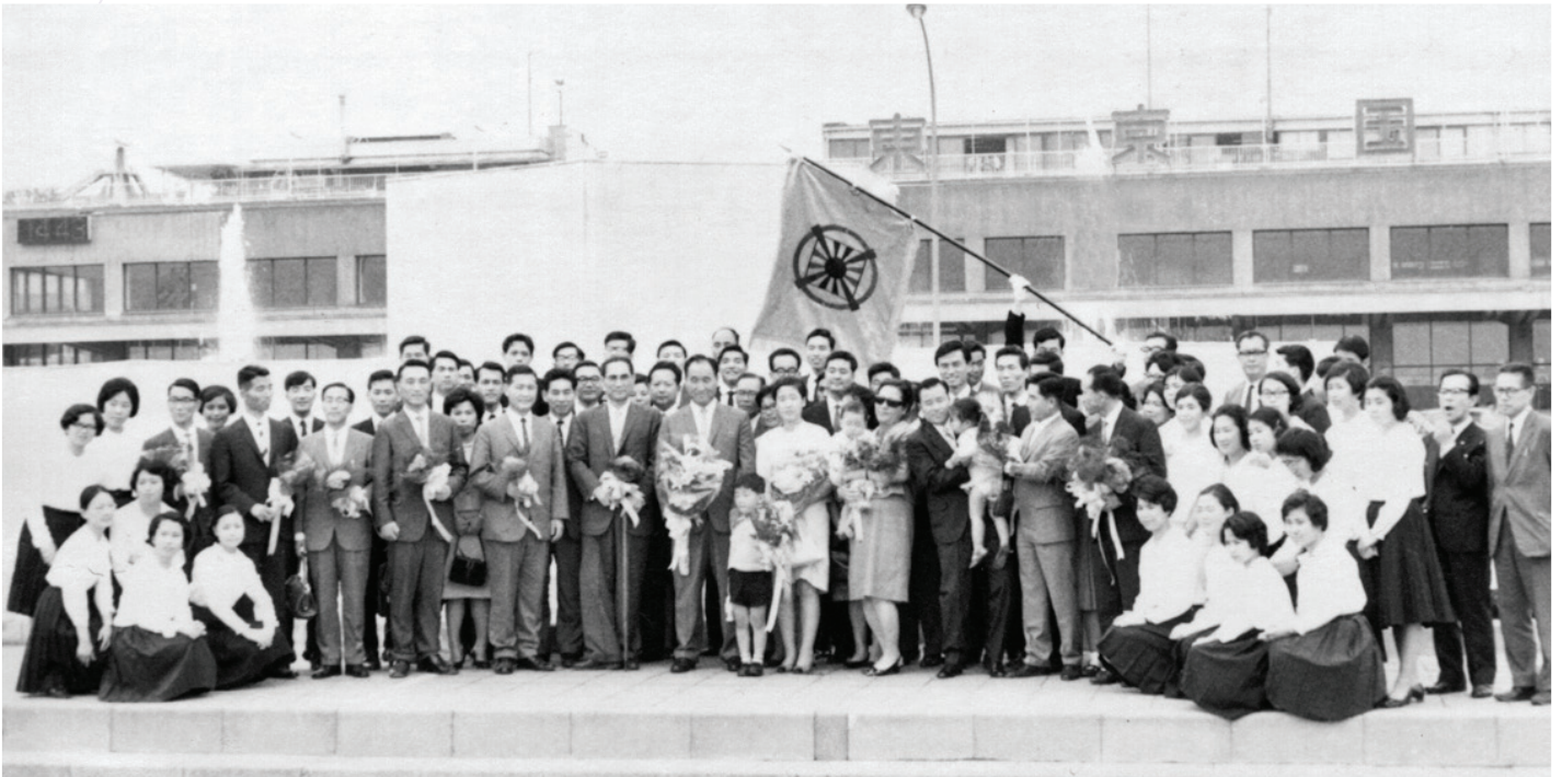
Japanese members welcome True Family members and accompanying church leaders at Haneda Airport in Tokyo, June 12, 1967.

I went to Japan thinking about giving the blessing to Japanese members, but they had not even dreamed of receiving it. They asked me if it could be in another two or three years. I felt very satisfied. They said they felt could not yet stand before God because they had not been able to put aside their own situations and live and work truly for the sake of Japan. This is the proper attitude to have. TW