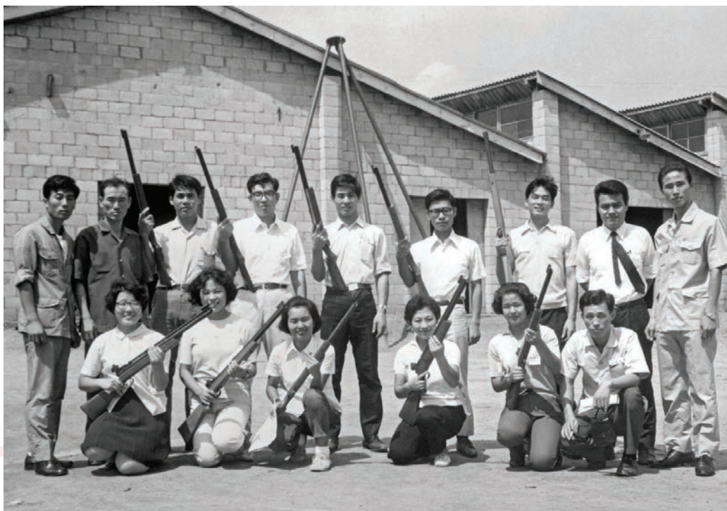
An elder member recalls, "Now we are trying to create unity. In those days, they were just the enemy. We always had to worry about North Korean invasion." Air shotguns are designed for hunting birds or small animals, but Father hoped the Yehwa air guns would also help South Korean citizens train themselves to protect their nation. This photo shows members holding Yehwa air guns in front of the factory where they were produced.